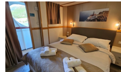
VIP upper deck cabin