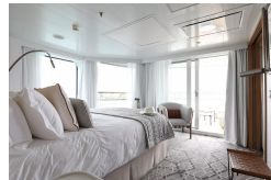
Prestige Stateroom Deck 4